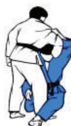
6. Performance version Yoko-kata-guruma-otoshi