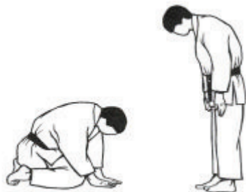
1. Za-rei and Tachi-rei